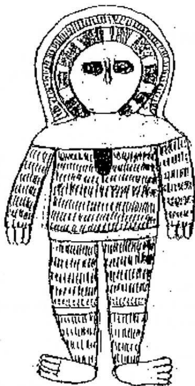
Fig 1. Wandjina

We were now at a loss but set out again. After travelling east across Kakadu National Park we were at the border of Arnhem Land. The landscape is dramatic and I wondered whether the ancient rocks, dignified and majestic, perhaps hold secrets of momentous events in the life of humankind from the long distant past.